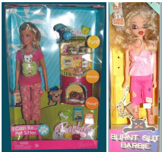
A funny photo from the recent PSI Conference. No one wants to be Burnt Out Barbie!